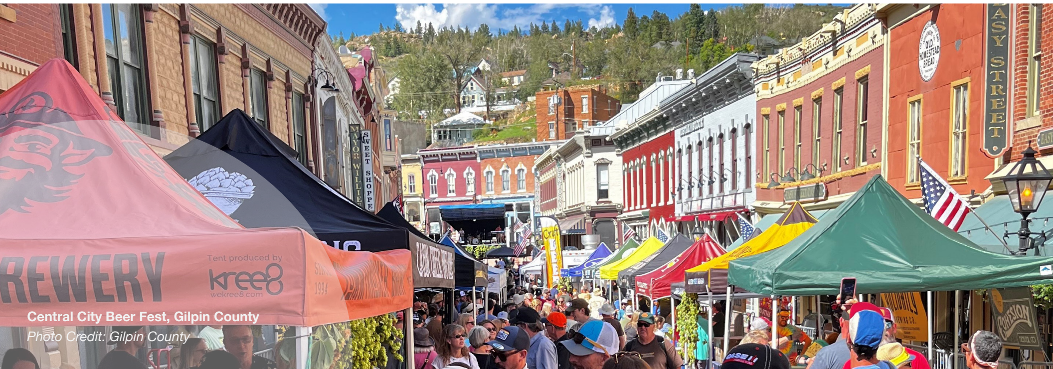
Central City Beer Fest, Gilpin County