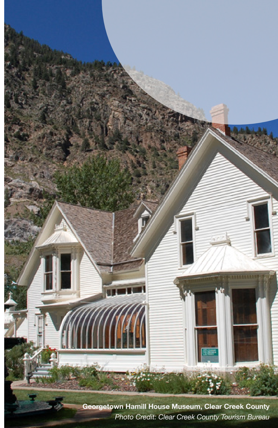
Georgetown Hamill House Museum, Clear Creek County