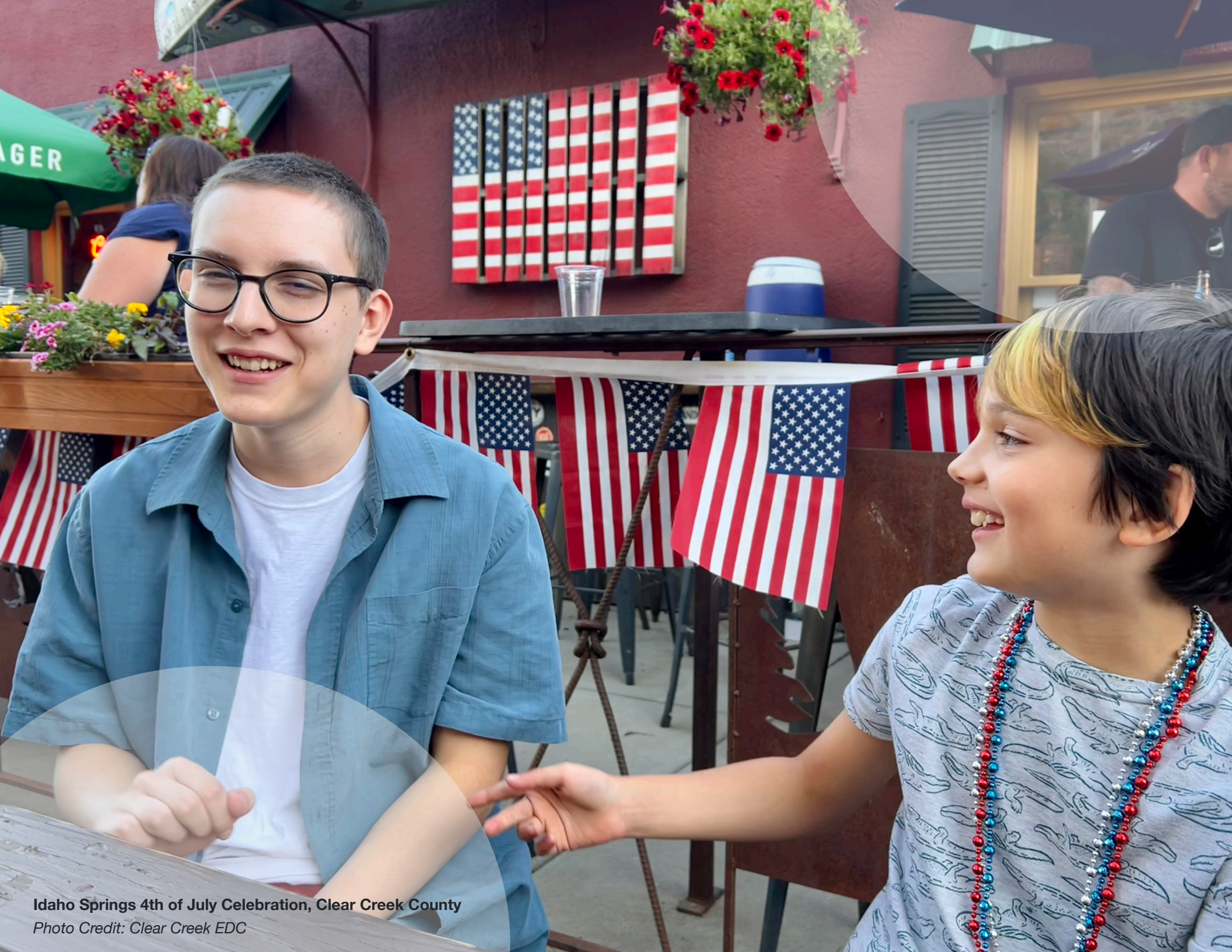
Idaho Springs 4th of July Celebration, Clear Creek County