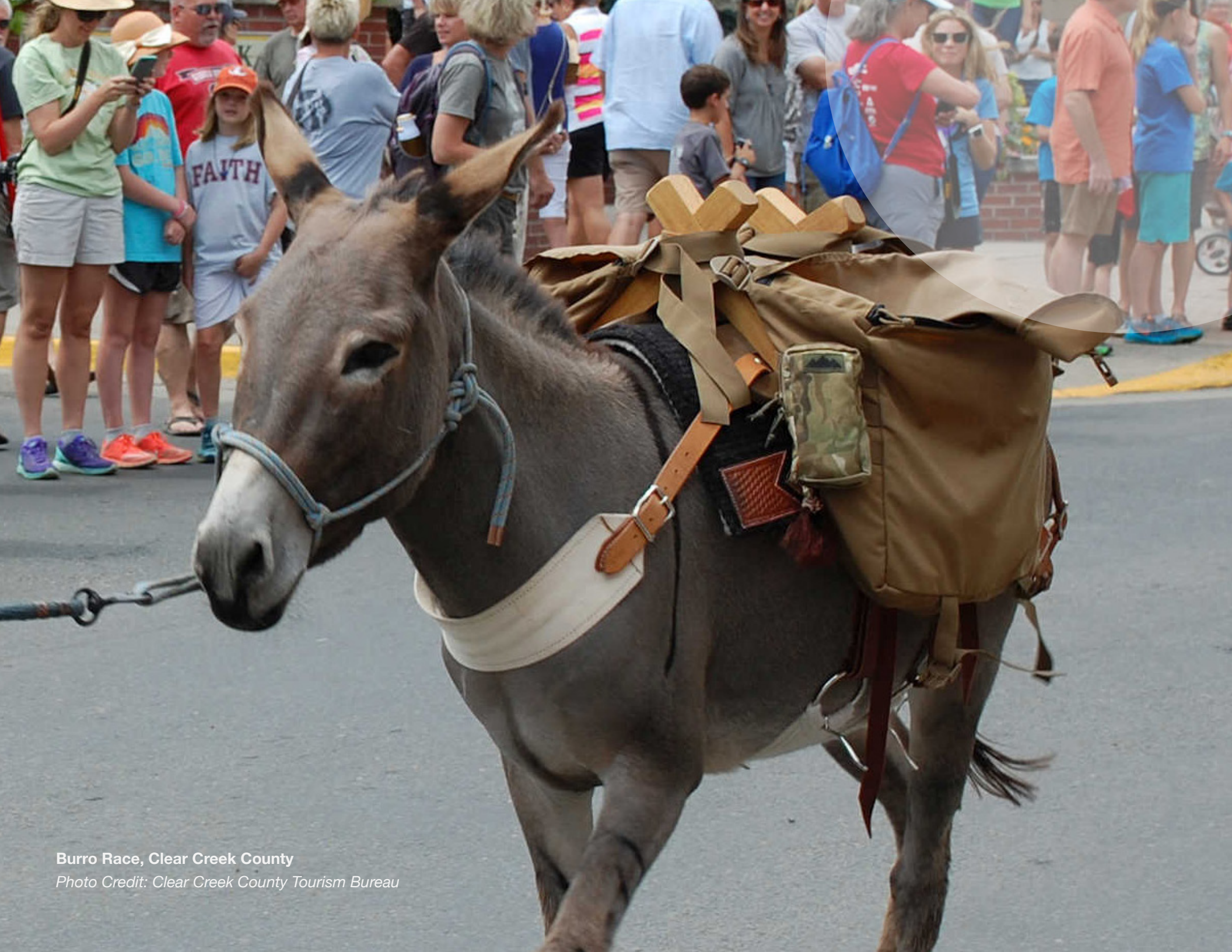
Burro Race, Clear Creek County