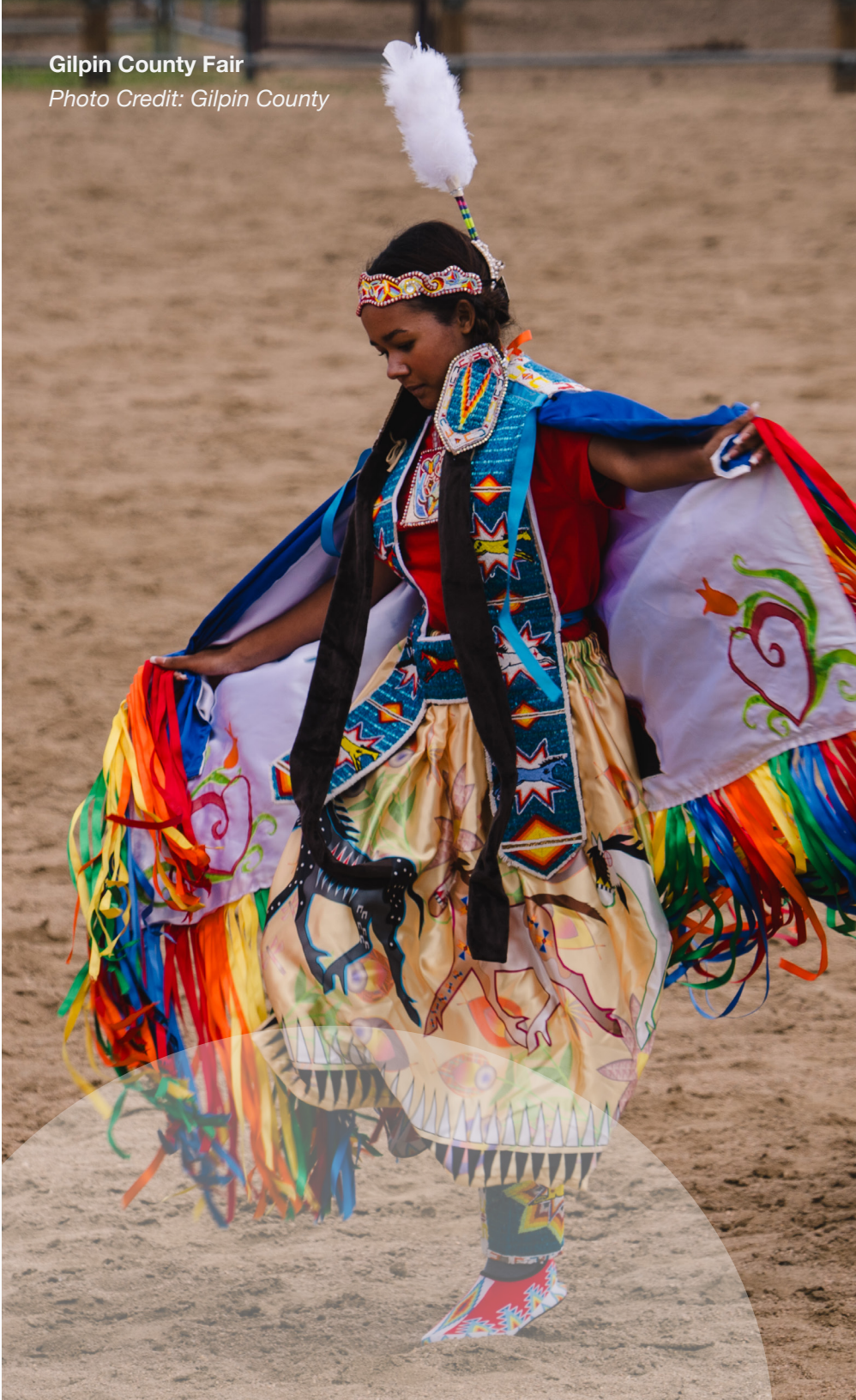
Gilpin County Fair