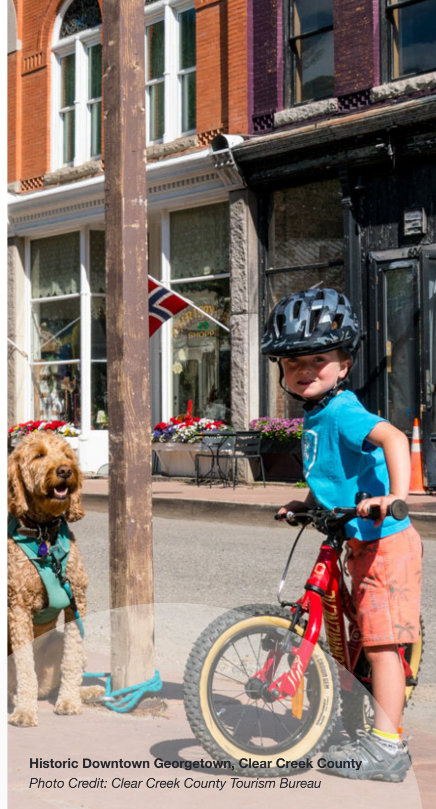
Historic Downtown Georgetown, Clear Creek County