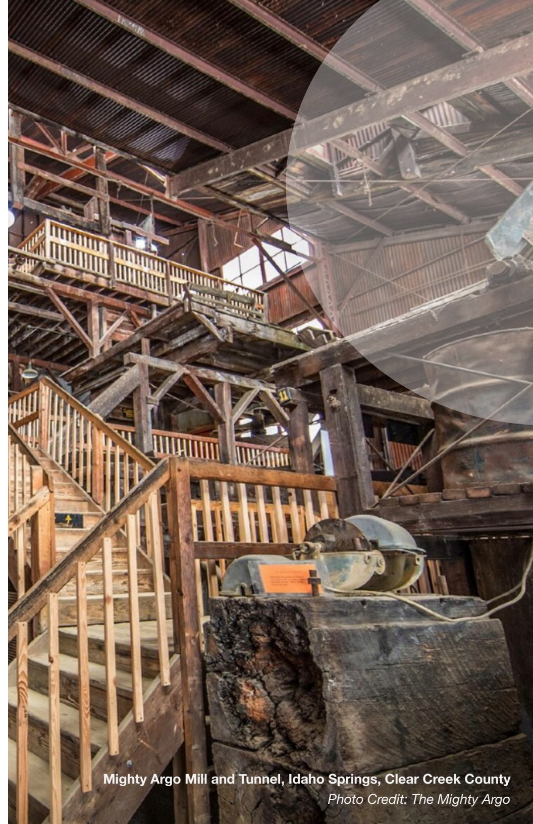
Mighty Argo Mill and Tunnel, Idaho Springs, Clear Creek County