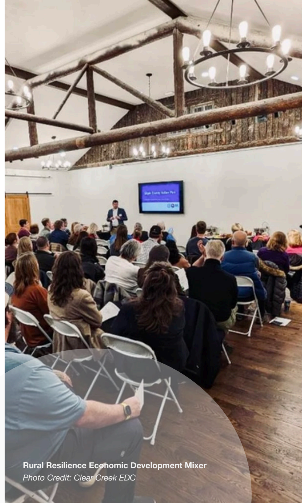
Rural Resilience Economic Development Mixer