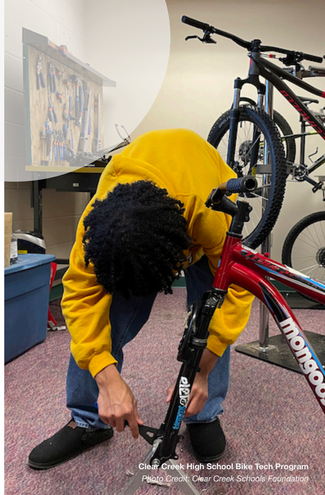
Clear Creek High School Bike Tech Program