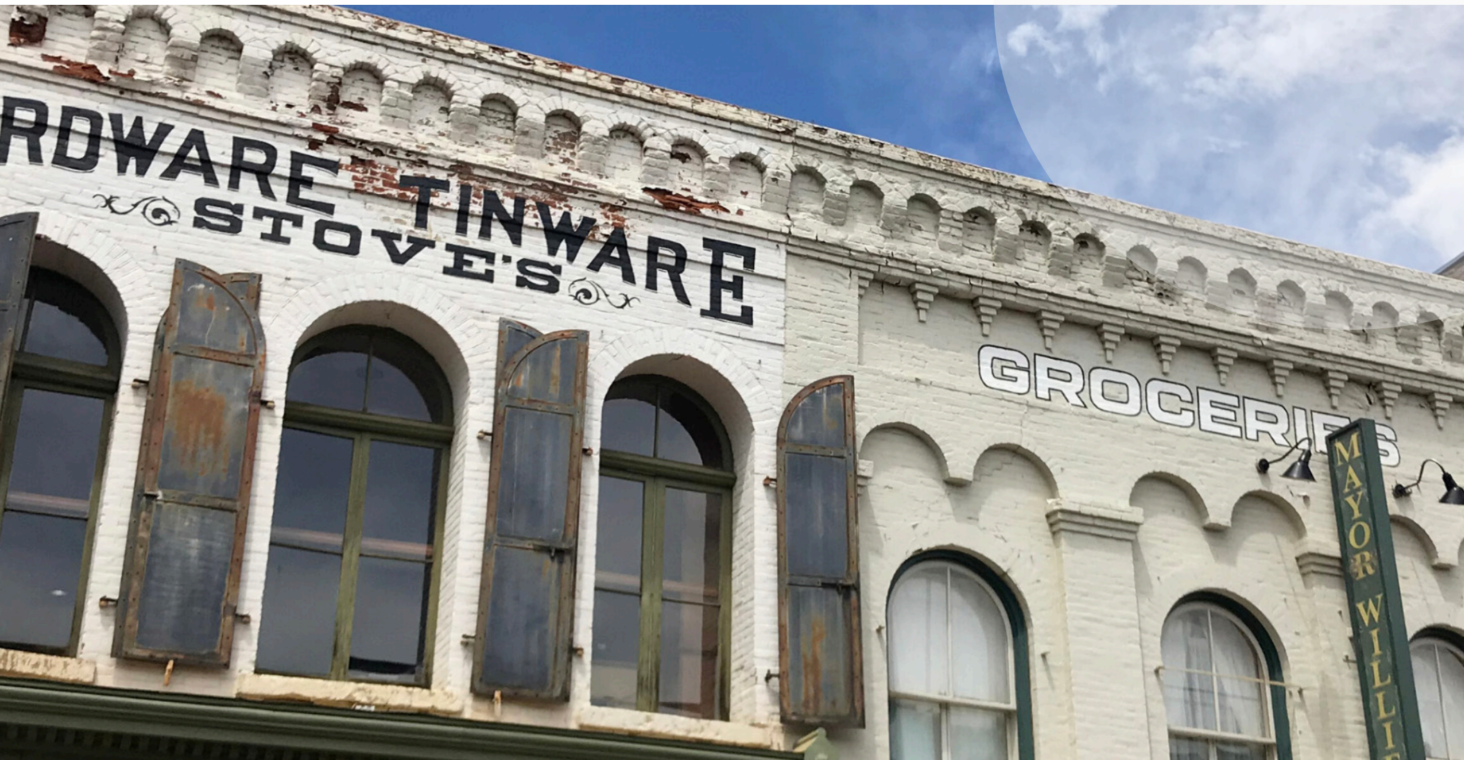
Historic Central City, Gilpin County