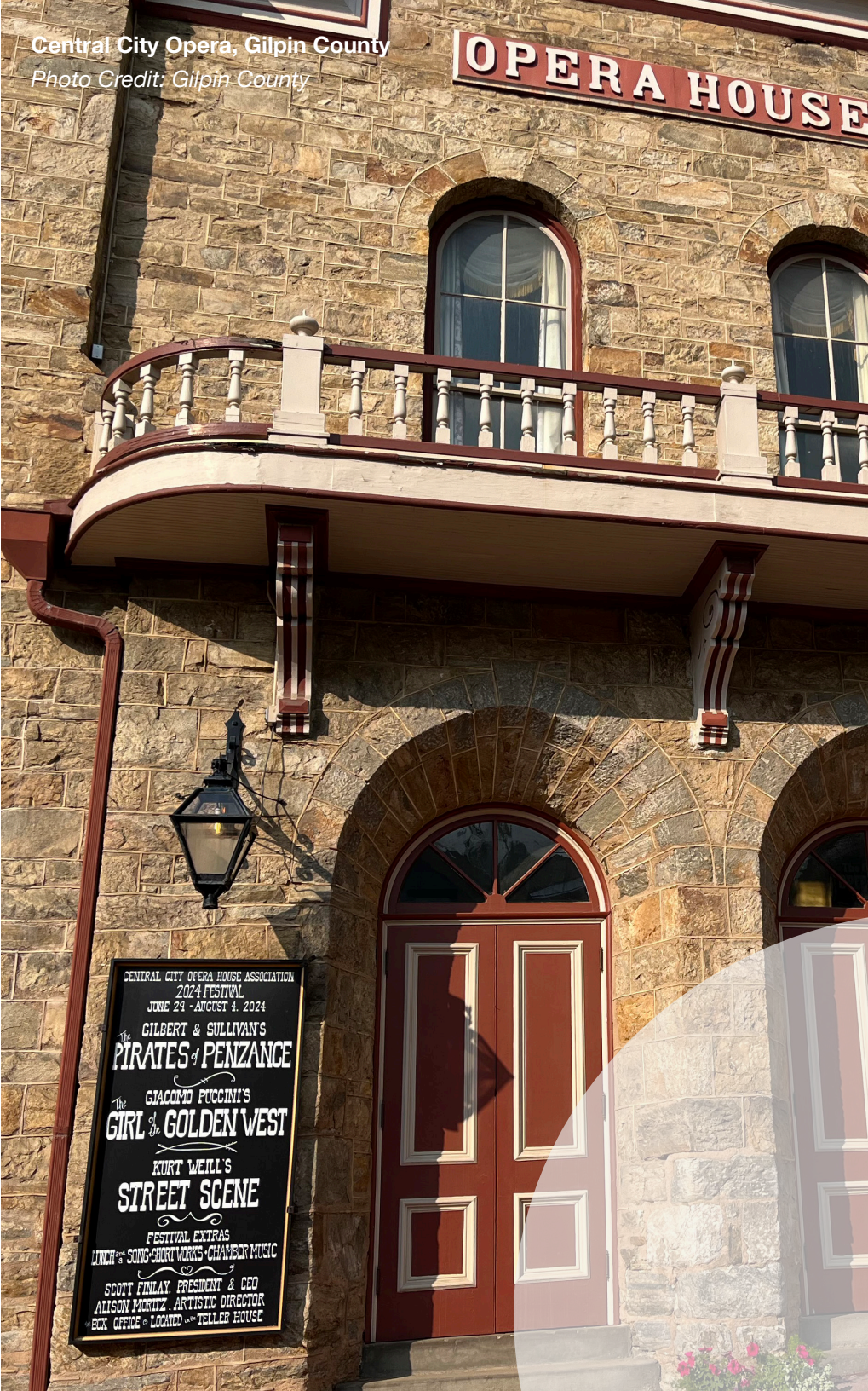
Central City Opera, Gilpin County