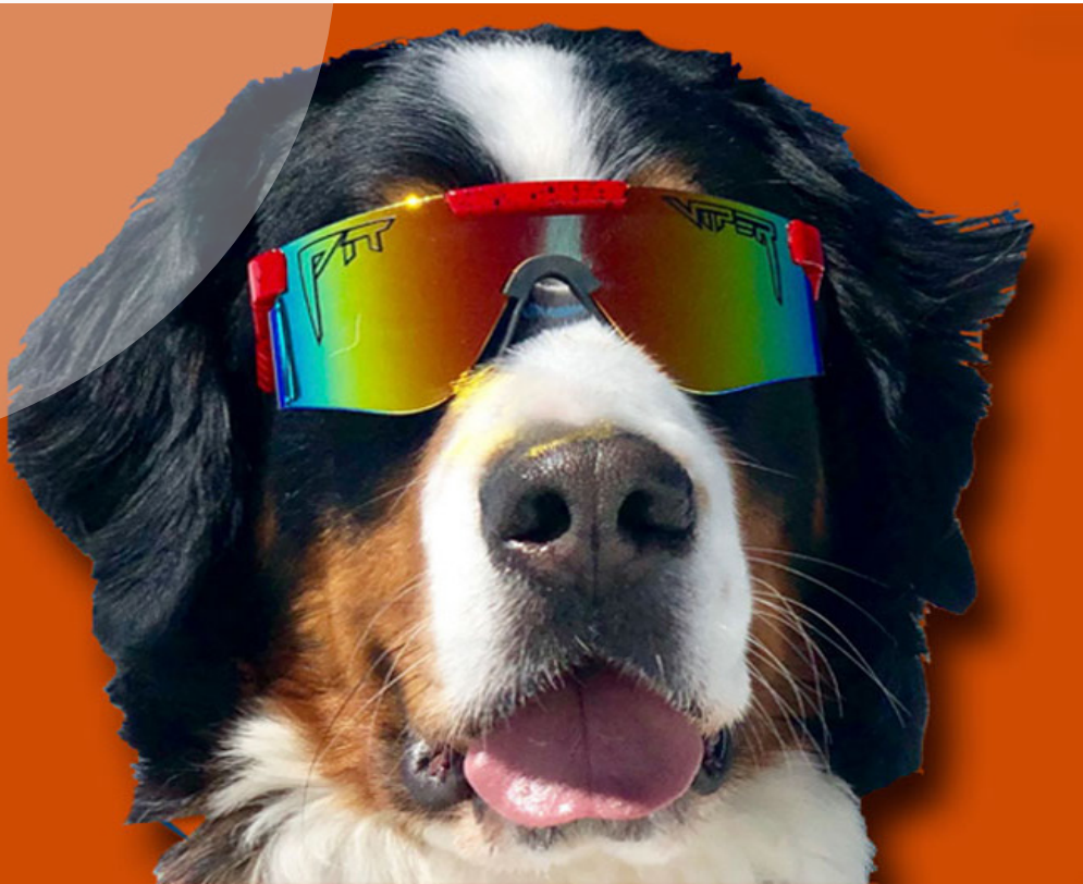
Parker the Snow Dog aka Mayor of Georgetown, Clear Creek County