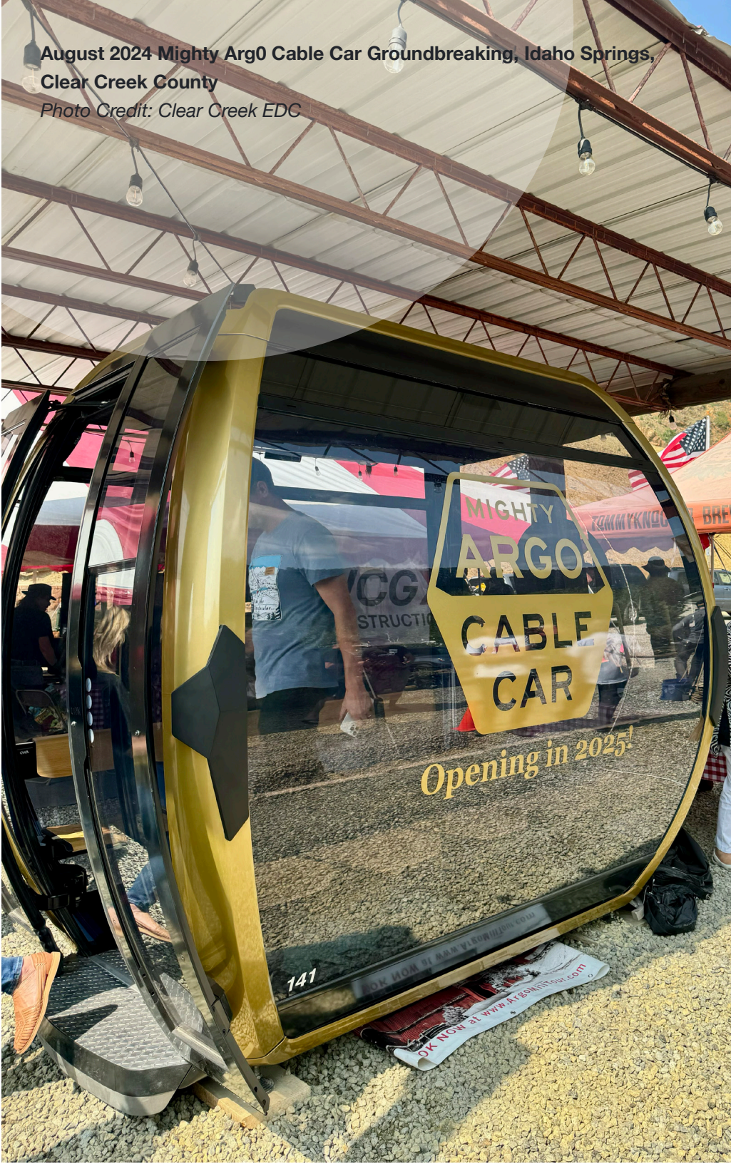
August 2024 Mighty Arg0 Cable Car Groundbreaking, Idaho Springs, Clear Creek County