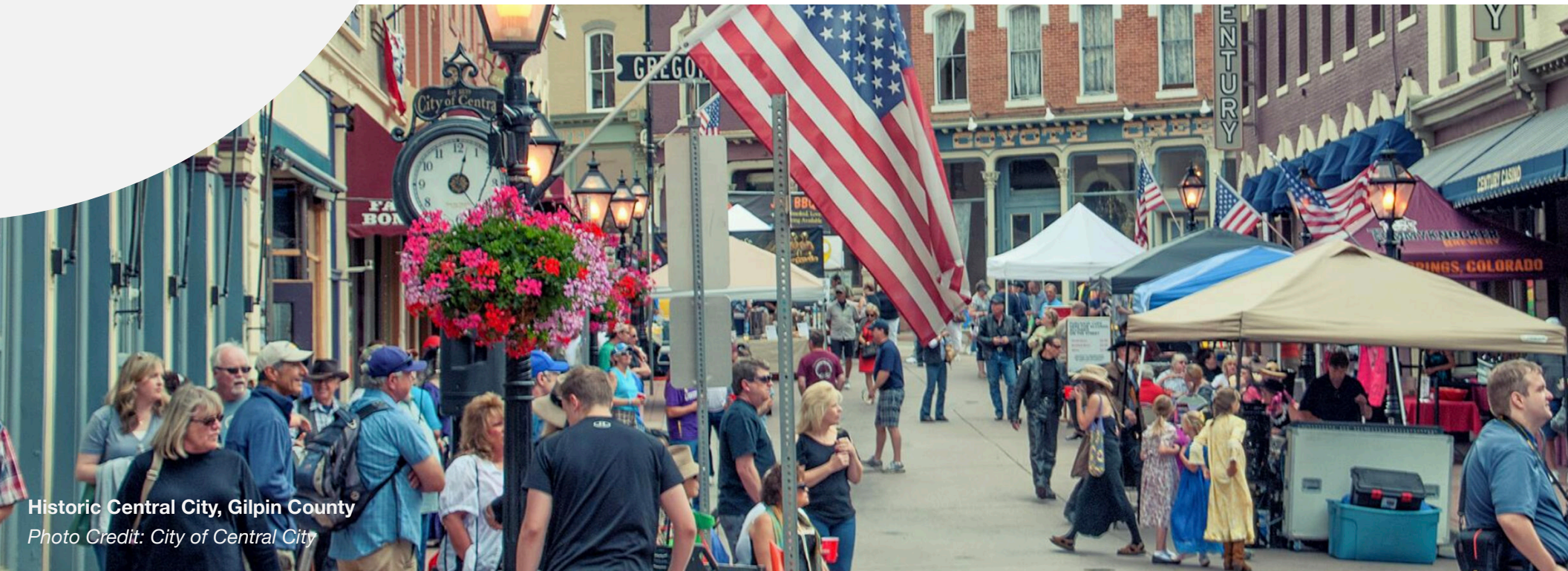
Historic Central City, Gilpin County

REGION 3: CLEAR CREEK AND GILPIN COUNTIES