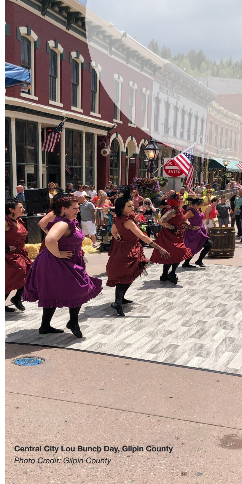
Central City Lou Bunch Day, Gilpin County

Investments in infrastructure allow new and existing businesses to thrive and prosper. (CEDs, Denver Regional Council of Governments, 2024, p. 26)