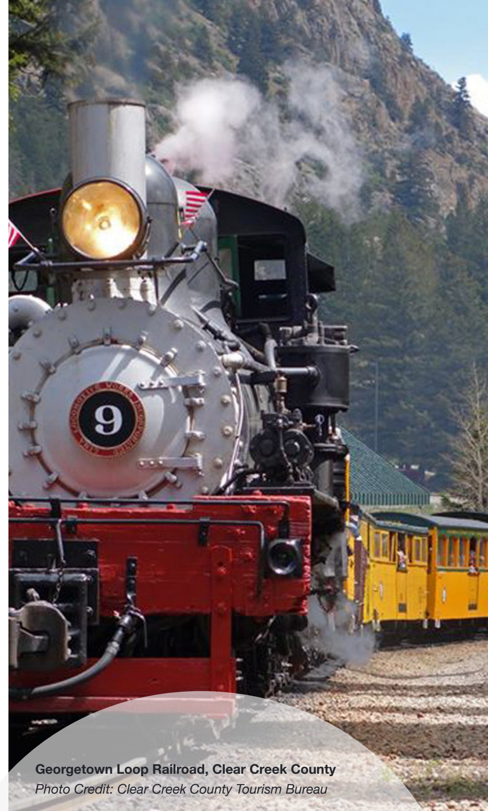
Georgetown Loop Railroad, Clear Creek County