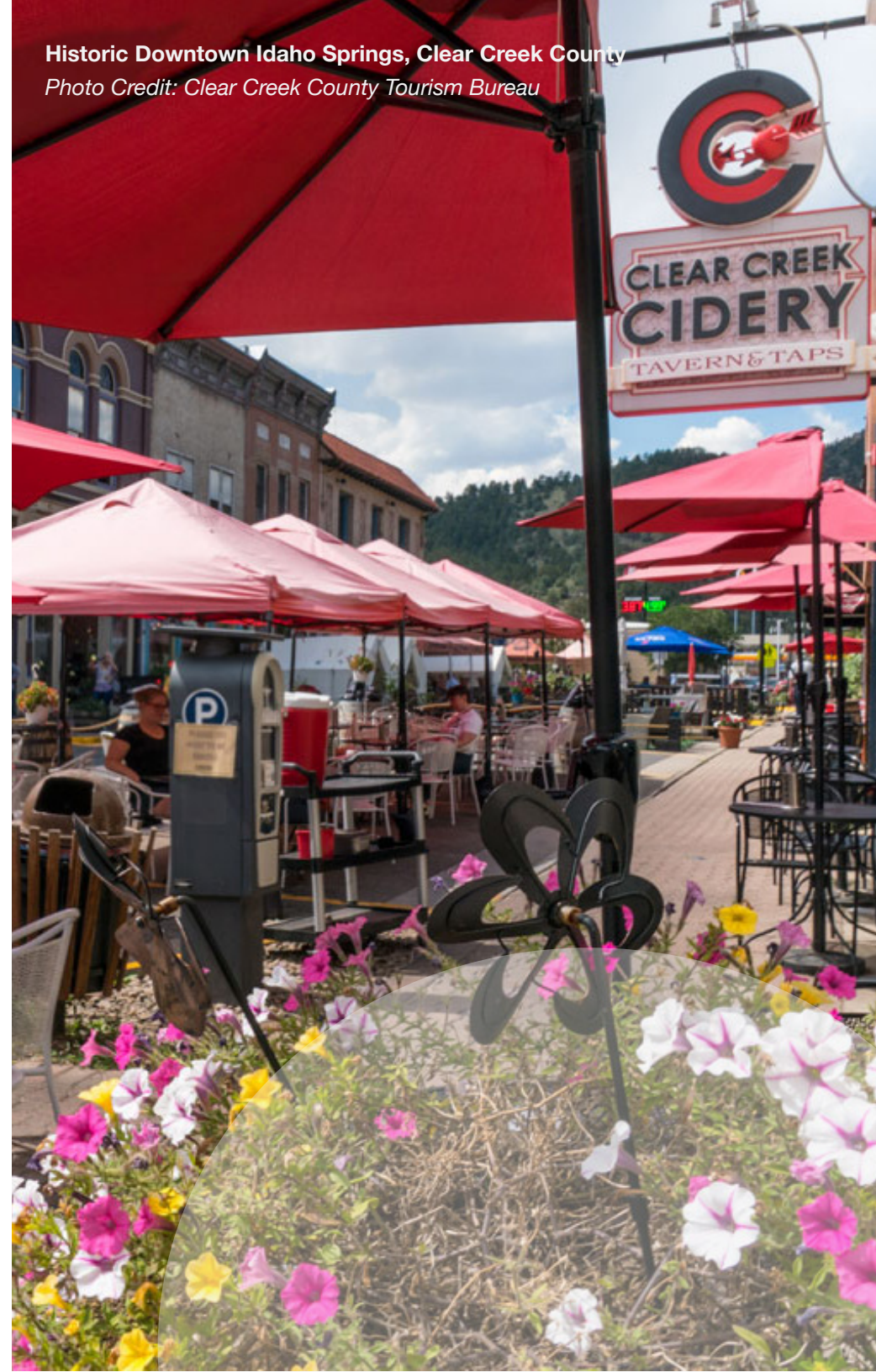
Historic Downtown Idaho Springs, Clear Creek County