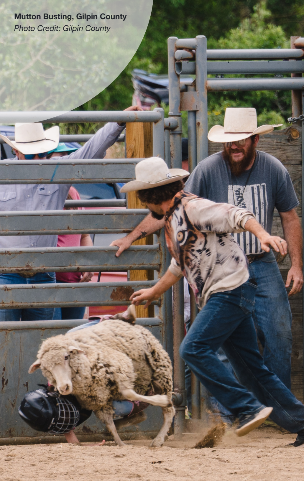
Mutton Busting, Gilpin County